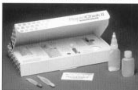
The RapidChek II system is a completely self-contained, on-site test for sulfate reducing bacteria.

When you pick up a RapidChek II test kit, you are holding everything you need to detect and enumerate sulfate reducing bacteria. You won't need syringes because there is no need for serial dilution. Pretreatment