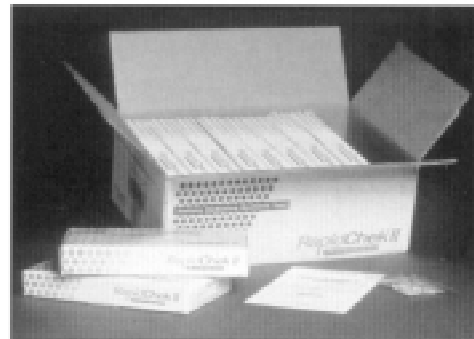
RapidChek II Ten-Pak

Immunochemical detection is leading-edge technology. To help you take advantage of this new