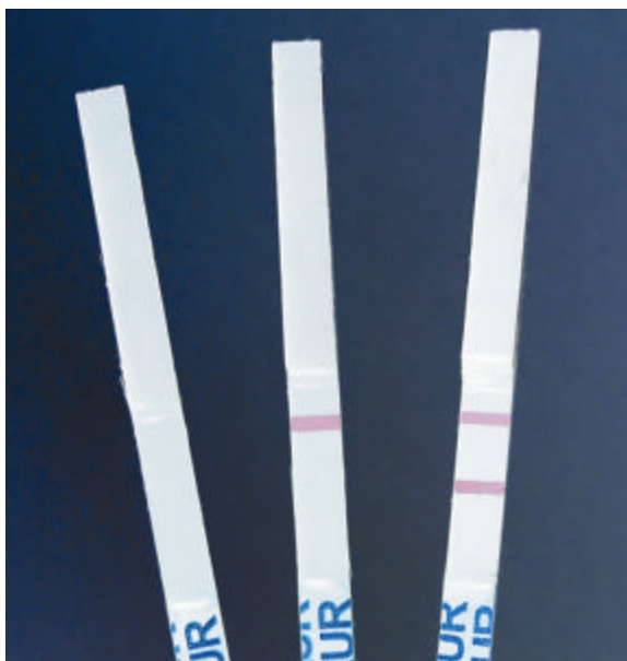
Example of an unreacted, negative (1-line) and positive (2-lines) test strip