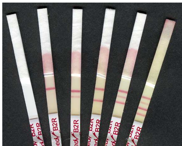
Example of test strip results (left to right)